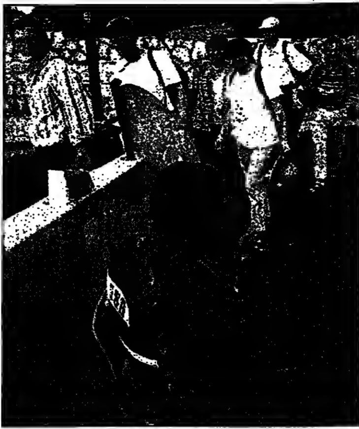
French tourists walk past an IDF checkpoint yesterday to visit Bethlehem, which Israeli tour buses have been barred from entering.